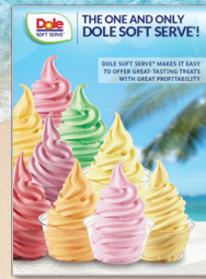
Full Line Brochure