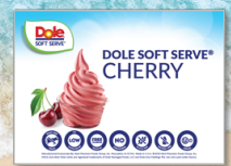
Flavor Tags 7in x 5in