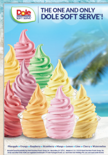
Posters 22in x 28in