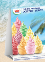
Table Tents 4in x 6in