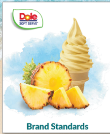
Brand Standards Guide